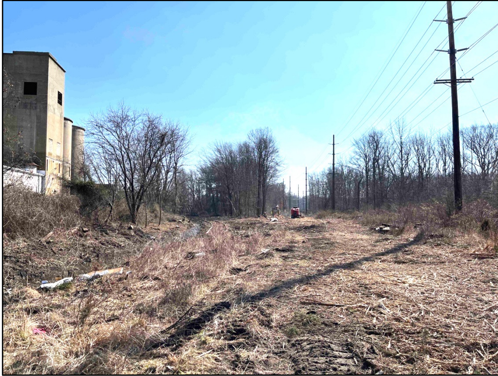
View of Delaware & Raritan River Railroad Freehold Branch facing (Timetable) South from Southard Avenue at Farmingdale shortly after vegetation clearing was completed in February 2023. The North leg of the Wye curves around to the left, while the South leg of the turnout continues straight.